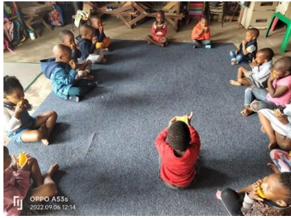
serving fruits after porridge