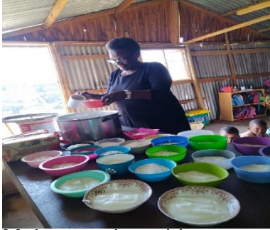
Maize meal porridge

Poverty still remains a main factor within the communities that we serve. Introduction of the porridge drive assisted greatly in our Wandering schools after several cases were reported by our ECD Teachers during our team meetings. We thank Pinetown Methodist church for a constant support in this. Still today, Phakamisa serves the porridge in the morning to Wandering schools.