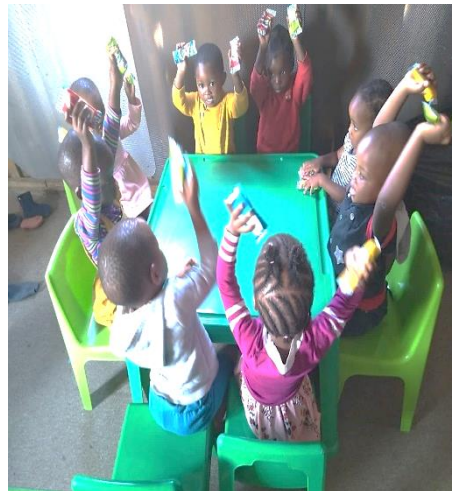
Easter eggs celebration